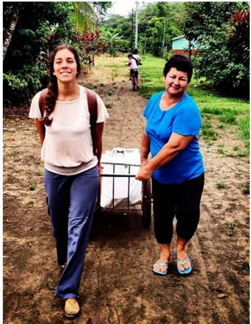
EARTH University student participates in community projects for sustainable development.

Given all of this, I hope that it is clear to the reader why I am so passionate about SHI. I learned about SHI while I was still at EARTH. I was thrilled to learn about its mission, which so closely aligns with EARTH University's mission. We had several student interns who completed internships with SHI projects, applying the skills acquired at EARTH over a full semester. Most importantly, they learned about the lives of the people impacted by SHI projects and how to build two-way bridges between the community and the university. These bridges are still being traveled by our students and community members.